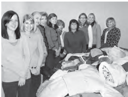
Employees of Burns and Levinson LLP present Horizons for Homeless Children with coats for children at the Community Children's Centers.