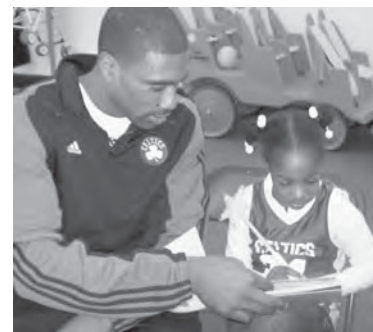
Leon Powe makes a friend during his recent visit to the CCC in Roxbury.

In December, in conjunction with the Boston Celtics and Comcast SportsNet, a new 30-second PSA was produced for HHC. Celtics player Leon Powe took the time to speak on behalf of HHC, in an effort to promote statewide volunteer opportunities. Later in January, Powe, along with members of the Celtics Women's Group, visited the Edgerley Family Community Children's Center in Roxbury to read and participate in arts and crafts activities with the children. The event brought much joy to the classrooms and media coverage of the visit helped build awareness of the work of Horizons for Homeless Children.